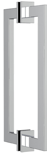
Double Door Handle